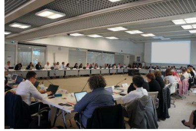
PIC/S Committee meeting in Geneva